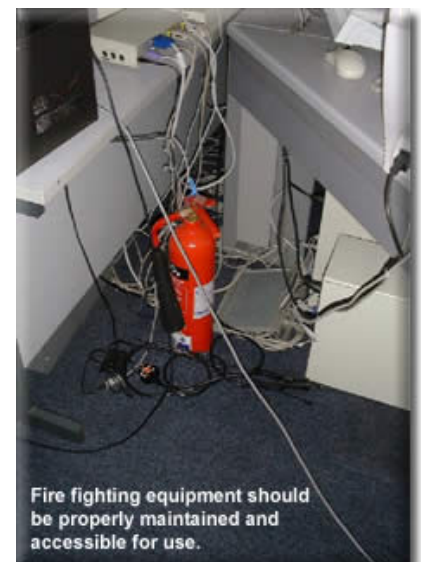
Fire fighting equipment should be properly maintained and accessible for use.

medium sized businesses do not have the resources in time or money to have an employee committed full time to this work and therefore allows for the appointment of third party assistance to complete the Fire Risk Assessment .